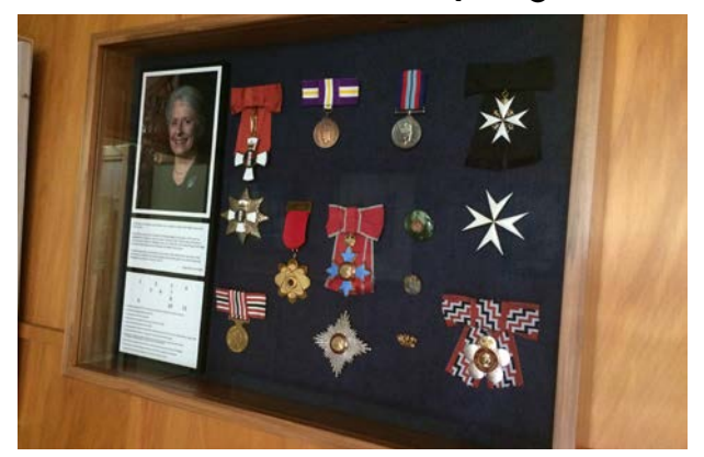
Dame Silvia Cartwright's collection of medals now on permanent display in the school foyer.